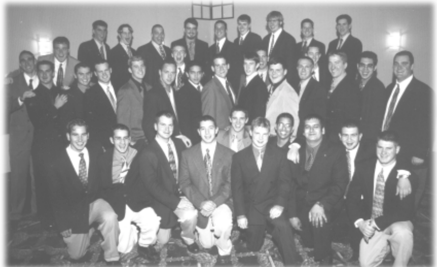
Joe's Colony Chapter